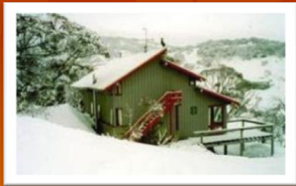
The best little ski lodge in Perisher Valley