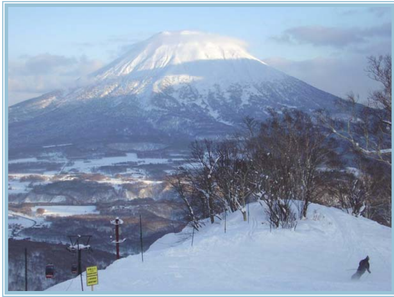
Sheer bliss at Hira-fu, late afternoon

For those who have not skied Japan, I'd thoroughly recommend it.