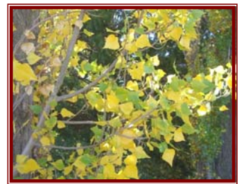
Snowy Mountains in autumn