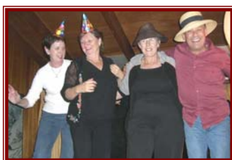
Work hard—party hard