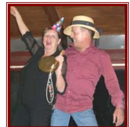
And the beat goes on...