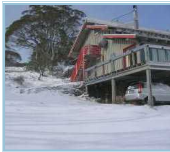
First snow of the 2007 season—last week of May

Phone: +61 2 6457 5200 Fax: +61 2 6457 5600 Email: ullrlodge1@telstra.com Web: www.ullrlodge.com.au