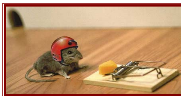
"Lids on Kids"

Know and observe the code it's your responsibility and have a great snow fun.