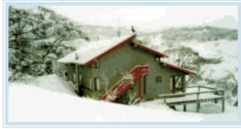
The best little ski lodge in Perisher Valley